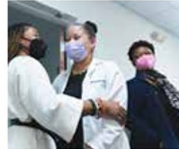
Integrated Health Care