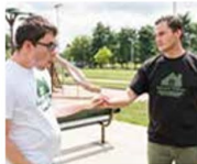
Intellectual & Developmental Disabilities