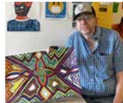
Arts & Culture

To view a full list of our programs visit www.rhd.org/our-programs or scan the QR code.