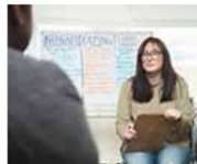
Drug & Alcohol Recovery