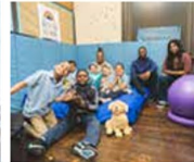
School-Based & Children's Services